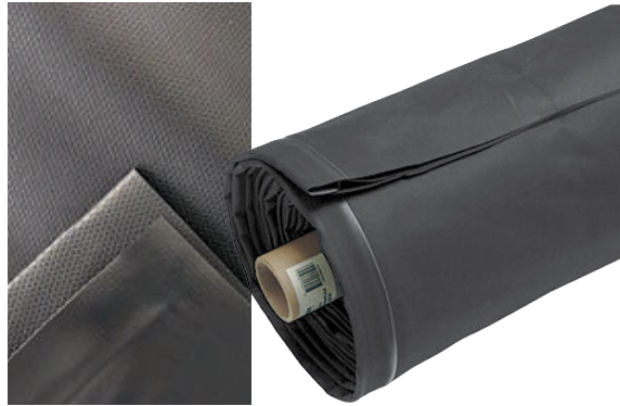
Top quality flexible frost resistant PVC liner

*Note: All roll sizes are nominal. **Cut to length pond liners are in whole metres only.