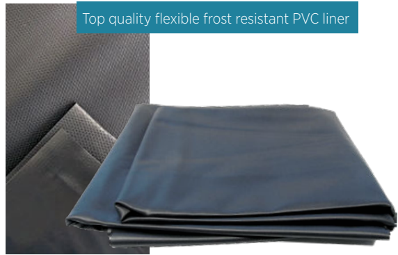
Top quality flexible frost resistant PVC liner

High quality European-made PVC pond liner. Flexible and easy to install, long lasting, versatile material. Liner pre-packs can be joined to make much larger pieces, either with tape or glue, or factory welding. Warranty does not cover breakdown due to UV, so ensure the liner is protected from direct sunlight.