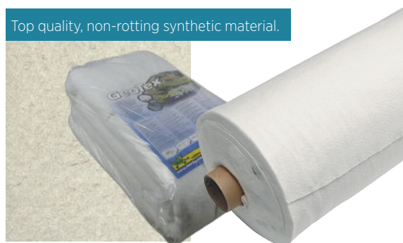
Top quality, non-rotting synthetic material.

This high quality synthetic fabric underlay will protect the pond liner from cuts and leaks from sharp objects, extending the life of the pond and making installation significantly easier. A worthwhile investment!