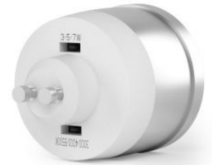
HV9506D & HV9506