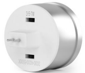
HV9507 & HV9508