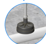
CONNECTION TO PC ONLINE DRIPPER