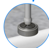
CONNECTION TO PCJ ONLINE DRIPPER