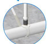
CONNECTION TO UNIRAM™