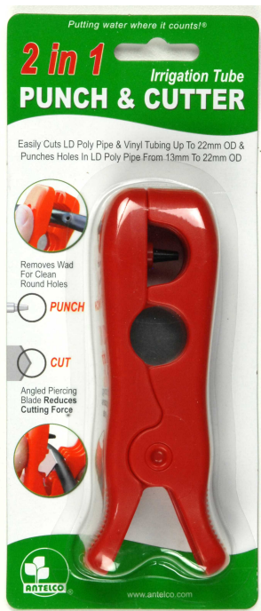
2 in 1 Punch & Cutter Retail Packaging