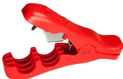
2 in 1 Punch & Cutter