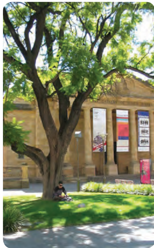
Toro Rootguard - SA Art Gallery

When SDI with Rootguard is installed below ground, the landscape surface is free from irrigation equipment allowing watering at any time without disrupting activities or causing injury.