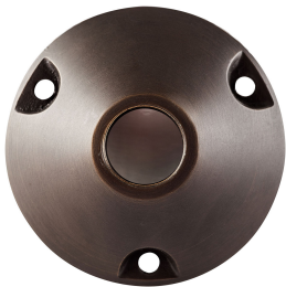
HV145-BASE Optional mounting bracket (sold seperately)